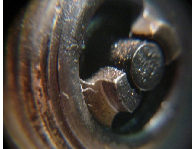
FIGURE 2 COPPER DEPOSITS ON ELECTRODES