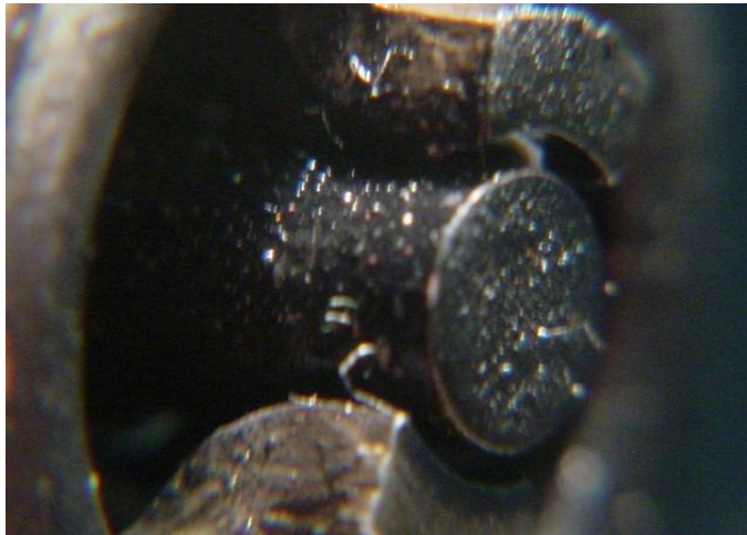
FIGURE 3 COPPER PARTICLES IN GAP