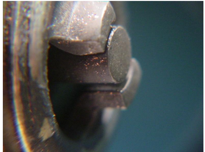
FIGURE 4 COPPER DEPOSITS ON ELECTRODES