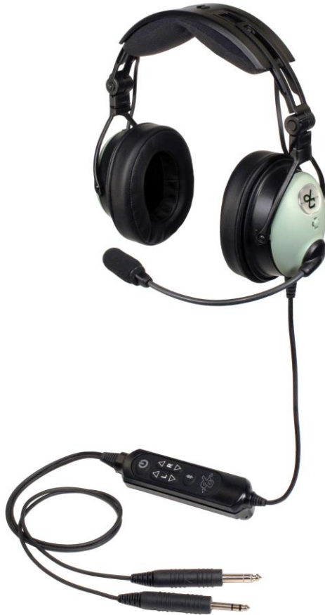
DC ONE-X Headset